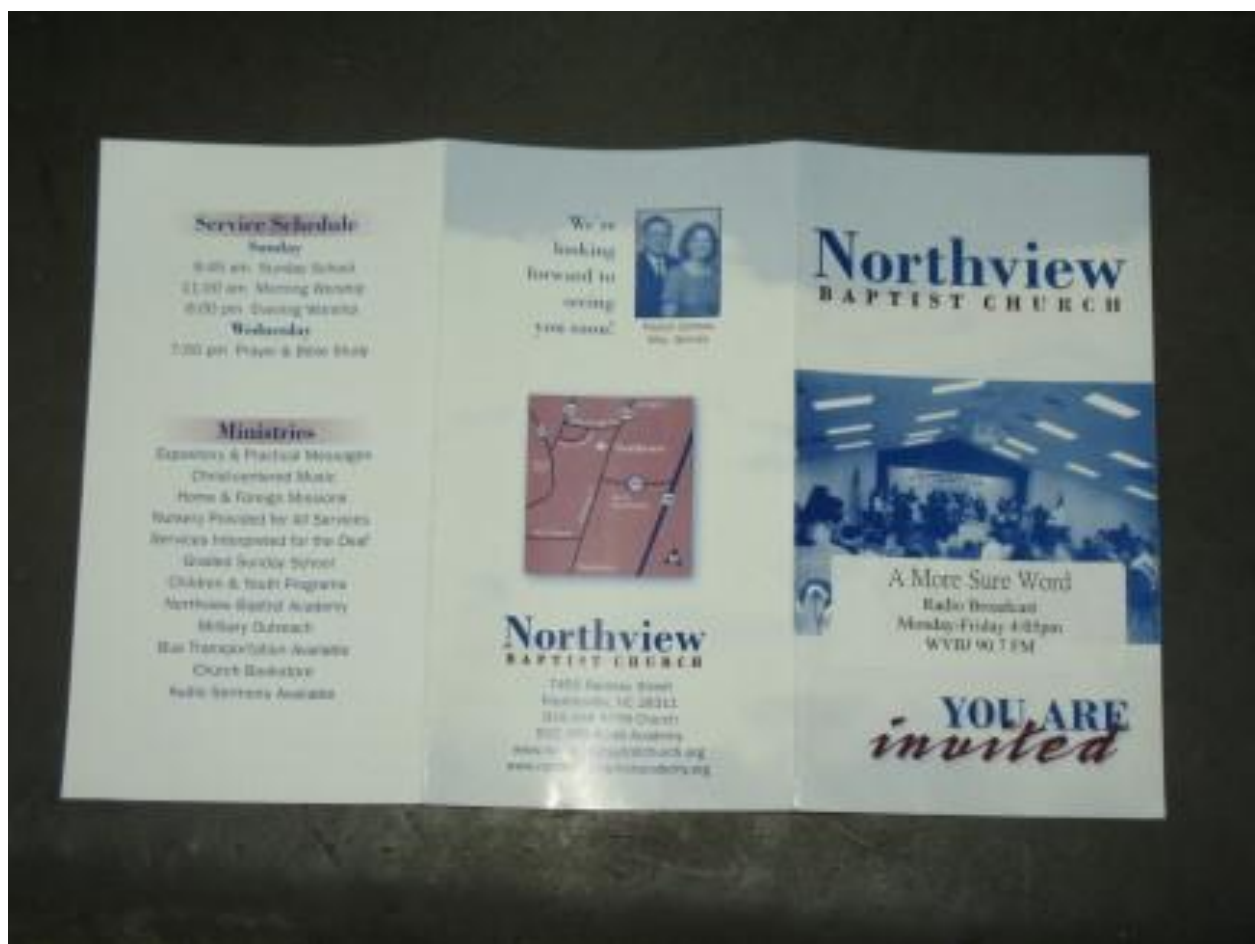
Northview Baptist Church – Tri-fold – Received 3.20.2011 – Note the “Radio Broadcast 90.7 FM” Sticker

OK, semi-encoded or “youth shorthand translated” – not a mind-boggling encryption scheme.